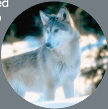
Timber Wolf Canis Lupus