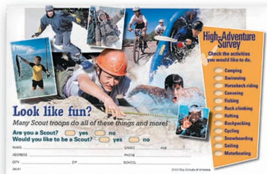
High-Adventure Survey, No. 34241. Available from your local council service center.